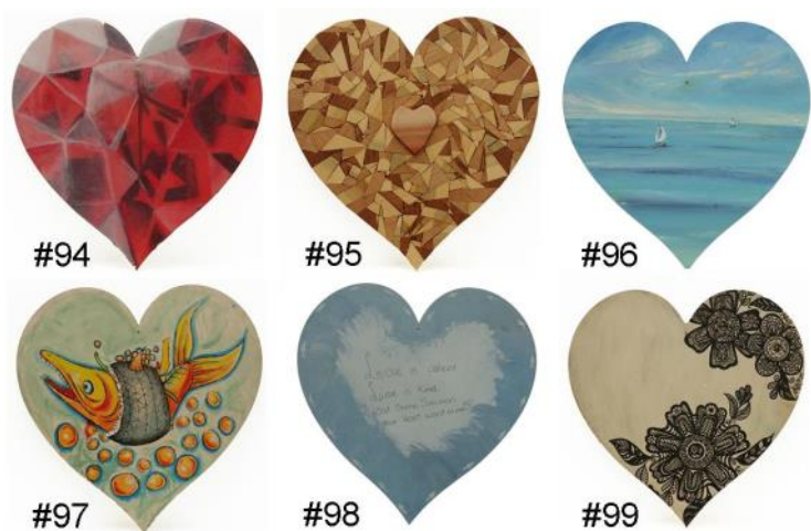
Skeena Salmon heART Auction